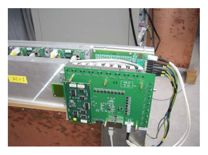
Fig. 2. CROS-3 Digitizers and Concentrator are on-chamber mounted system components