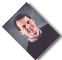
Figure 2—Image of the author scaled by 0.5 and rotated by 45°.